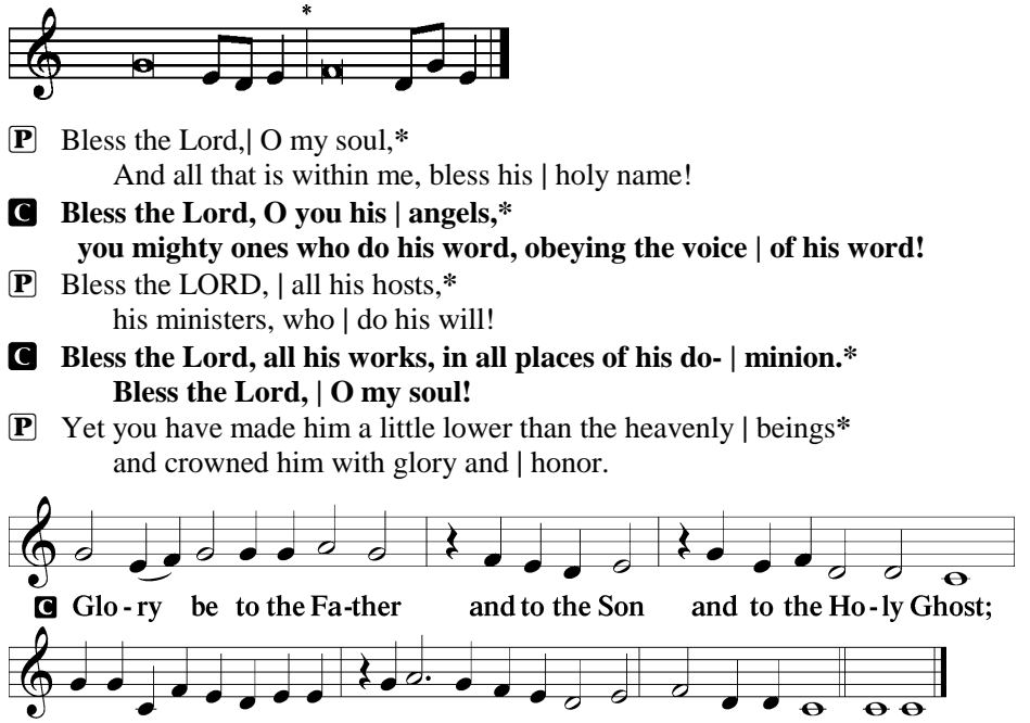
as it was in the be-gin-ning, is now, and ev-er shall be, world with-out end. A-men.

P Bless the Lord, | O my soul,* And all that is within me, bless his | holy name!